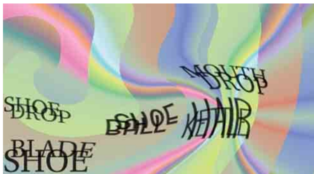
Figure 1. Can you read three words in this image?

Another application involves free email services. Several companies offer free email services that have suffered from a specific type of attack: “bots” that signed up for thousands of email accounts every